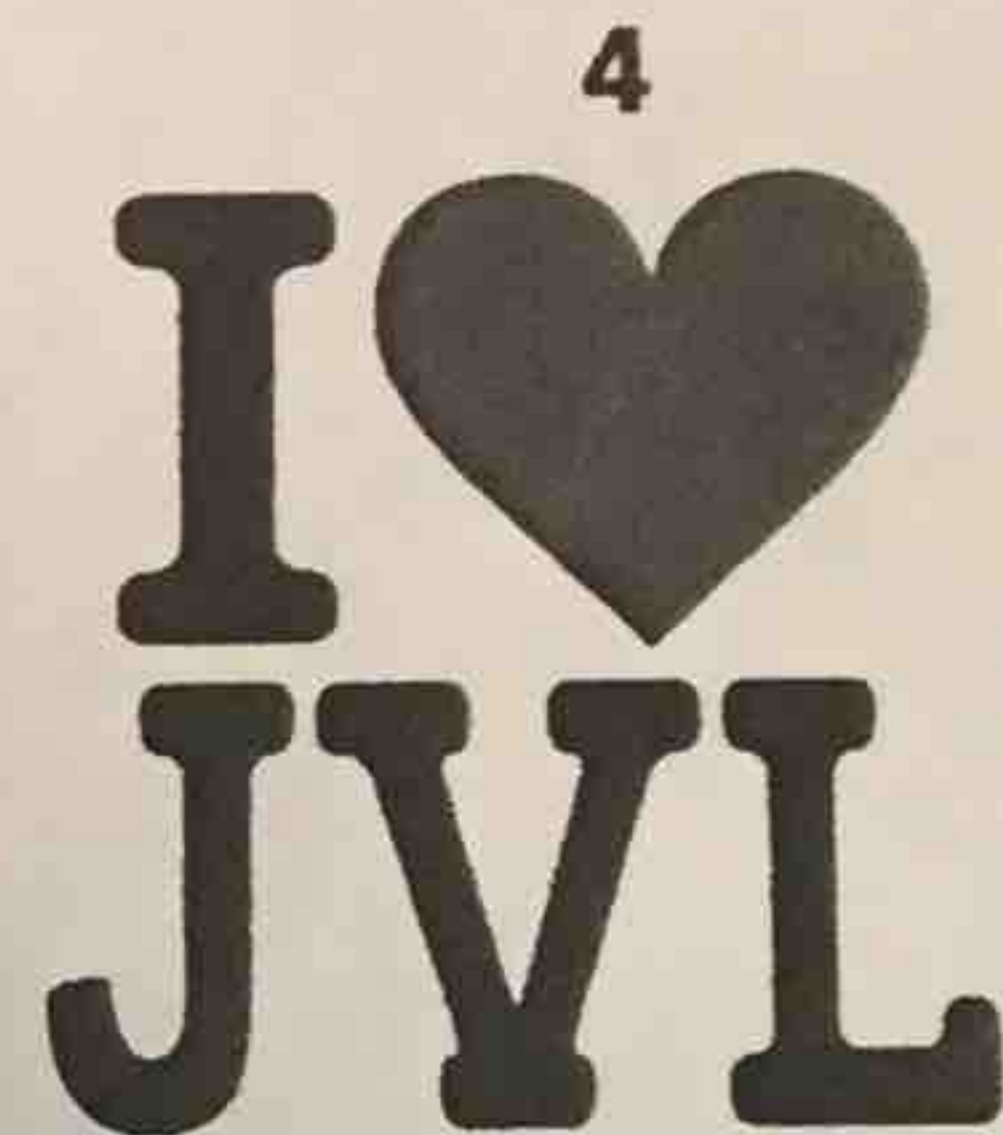
SCREEN PRINT OR GLITTER WHITE GARMENT