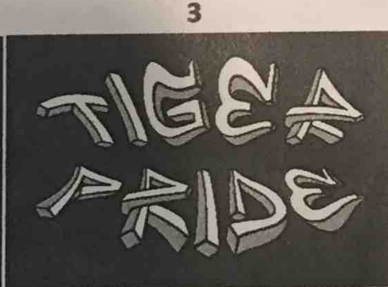
SCREEN PRINT ONLY RED GARMENT